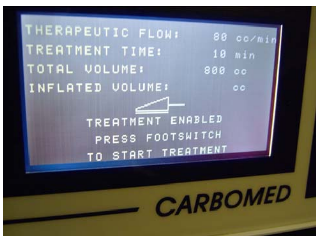
Fig. 1 Front panel of the Carbomed Programmable (CO 2 ) apparatus

The complications were minor and included pain at the injection site as well as crepitus and minor aches, which did not last more than 30 min. Some needle-entry bruising was noted, which resolved within 7 to 10 days. No other side effects were observed.